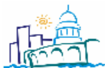
CMSA Madison WI

Sponsored by: CMSA Madison Chapter 1.0 CEUs Approved